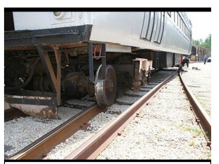
Car 44 De-railed

Regular operations will resume after the repairs are completed and inspected.